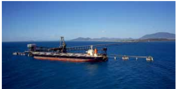
Ship Loading at the Port of Abbot Point

All EIS documents for Public Review are available on the EPA website www.epa.qld.gov.au